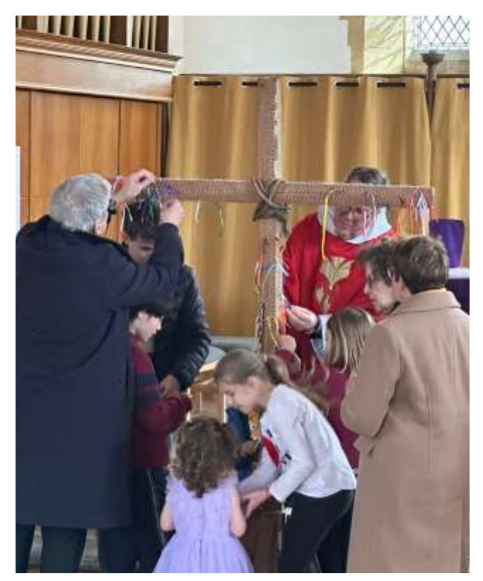
Palm Sunday: 24th March