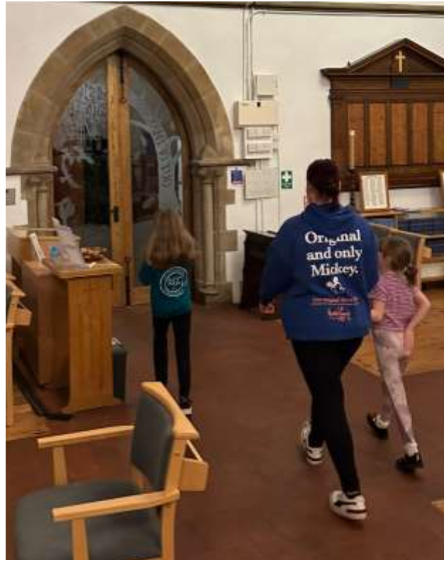
The children looking for Elijah at the start of the meal.

Holy Week Meal The Holy Week meal was shared on Tuesday 26th March.