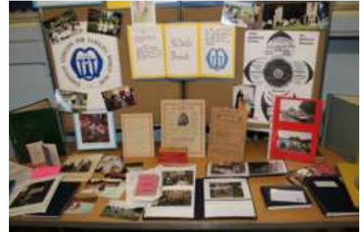
Mothers' Union Moving On Service

Actions approved under this Plan included running Alpha courses for adults and young people and interactive Bible courses during Lent and the Autumn. Innovative Holy Week services, particularly a Good Friday service involving guided imagery and walking meditation, were introduced and were found very meaningful by attendees. Starting in September a monthly Forest Church for families has run on Sunday afternoons, involving activities in local woods and in the church garden. Further details are set out in the report of the Pastoral and Evangelism Committee.