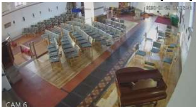
Inside the Church after reordering

The result of the renovation and re-organising has been a much more open, far brighter and