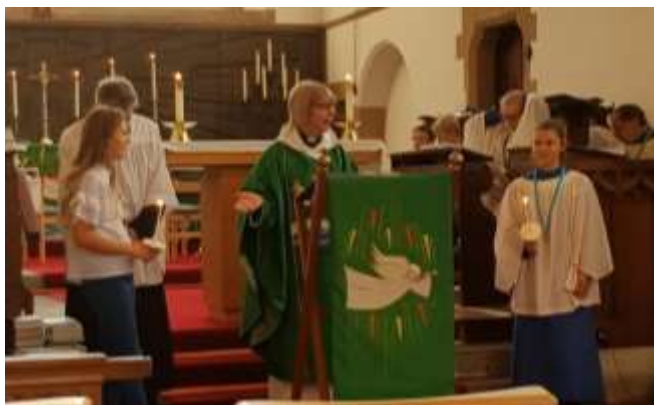
Preparing for 1 st Communion

The Ascension Day Service was held at St Peter's Mill End where we had a very enlightening talk about the work of USPG. The choir from the collective churches was very much appreciated as was the hospitality of St Peter's.