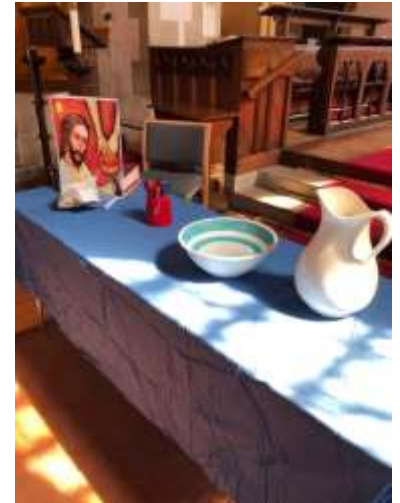
Good Friday reflections