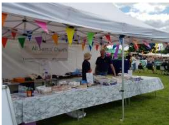
All Saints' at Croxley Revels

The excellent financial performance of the Christmas Market and jumble sales resulted in fundraising exceeding budget by £2,835. Hall booking income also did well and exceeded budget by £5,934. These two items in particular helped to offset other costs and enabled us to break even.