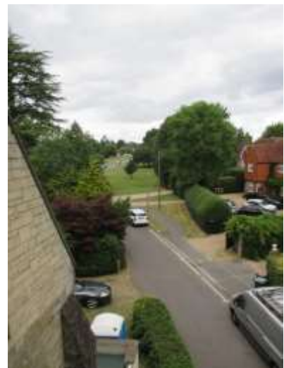
View from the Church Roof

It was through the generous bequests of people who were cherished members of our church family in years gone by that has enabled us to replace the roof tiles on the south side of the church, install a new visual and sound system, remove the pews