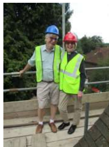
Checking the Roof

What is contained in this year's report is the result of planning recounted in detail in last year's report where the arguments for the work were set out in detail.