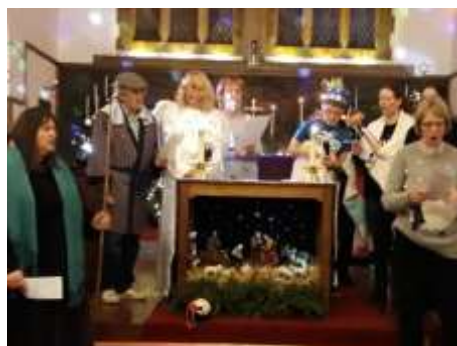
Christmas Crib Service