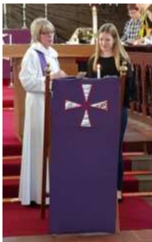
Preparing for Baptism