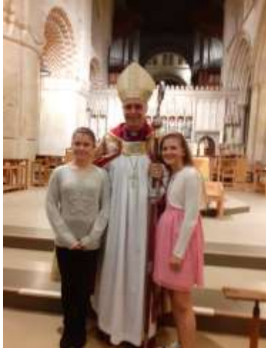
Confirmation at St Albans Abbey