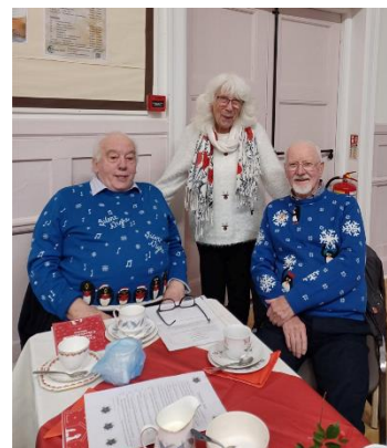
Christmas Afternoon Tea and Carols