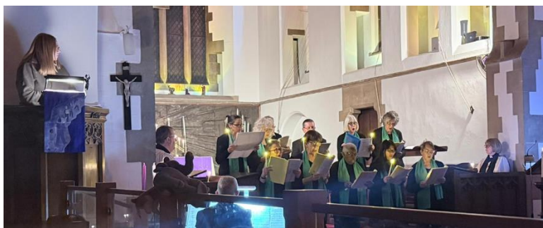
The Choir at Advent Evening Service