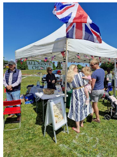
VE Day Community Picnic

Also, in November, we provided the refreshments for the Deanery Confirmation Service which was held at All Saints'. We also organised the refreshments for the Advent Service at the end of the month.