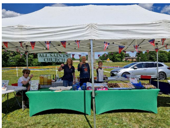
VE Day Community Picnic