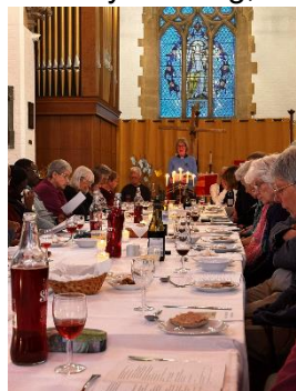
Holy Week Meal

Monday evening, we had a service of prayer for healing.