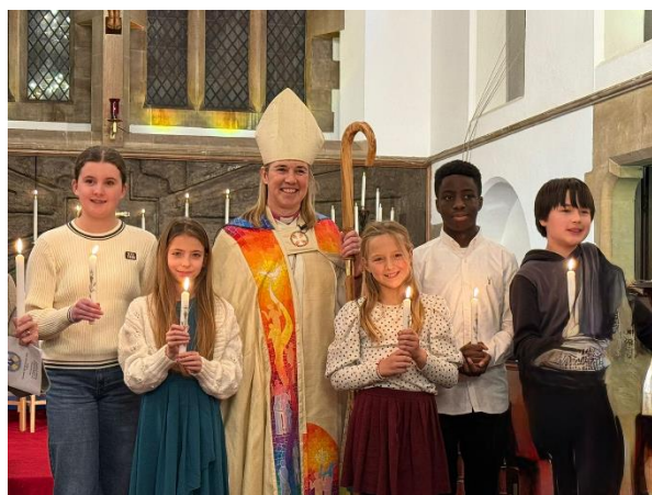
Confirmation in November