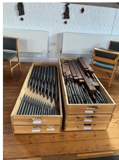
Organ Pipes Removed