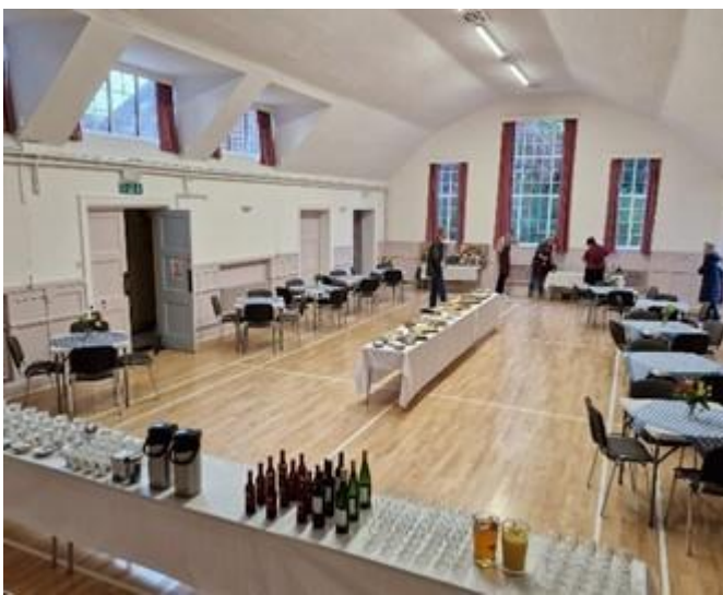
The Hall set up for a booking

When the Church Hall was opened in 1932, its purpose was a building that would serve in a sense as The Family House of the Congregation, a place where the family's business can be efficiently carried on . The reason was the mushrooming of Church activities, some sacred, some secular, that the Church building itself could no longer accommodate. Today, although that is still to some extent the case, the Hall has evolved into a major social centre for the village, underpinning much of All Saints' outreach activity and also a key source of Church income. All three functions demand a space that is multifunctional with the necessary high-grade supporting infrastructure, flexible, secure, safe and clean, as well as being attractive and welcoming. And where they exist, subscribing to national standards at the highest levels. It perhaps goes without saying that, having achieved these goals, which the last year fully demonstrates, they have to be maintained; something that requires constant vigilance on the part of the Hall Committee. That vigilance, of course, has to extend to recognising both challenges to its successful functioning and opportunities to extend and improve its range in underpinning both the Church's needs and those of the wider world of the village and beyond.